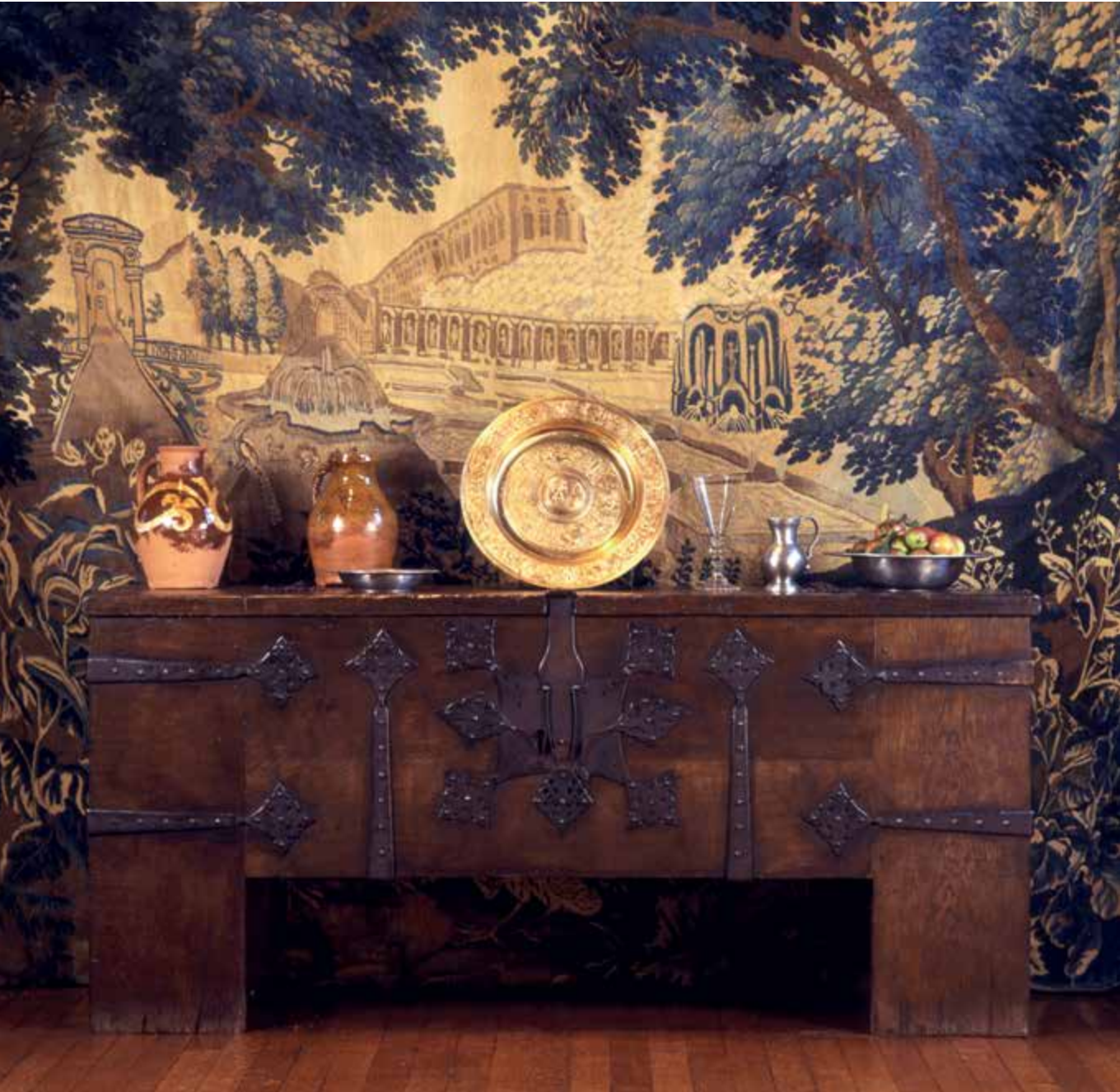
9. Medieval Coffin (C19) 188cm (w) x 63cm (d) x 91cm (h) £6,000.00 ex VAT £7,200.00 inc VAT