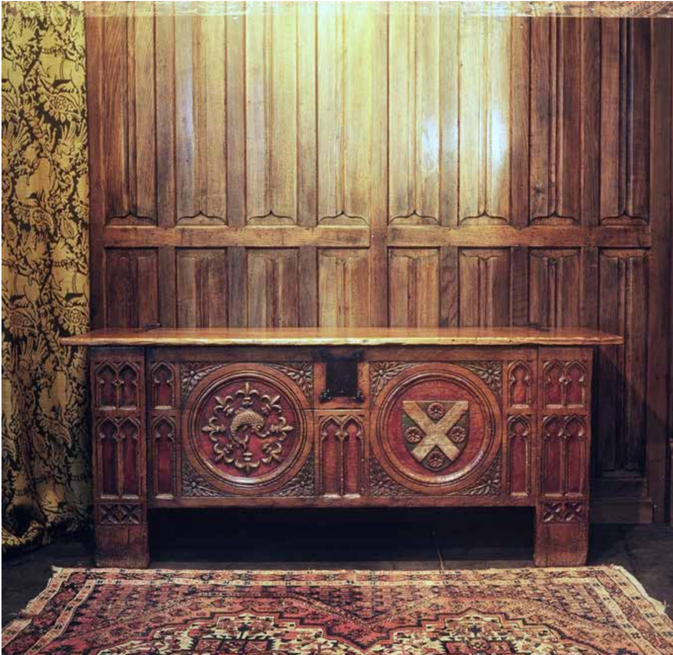
10. Medieval Great Chest (C16) 183cm (w) x 61cm (d) x 76cm (h) £4,879.17 ex VAT £5,855.00 inc VAT