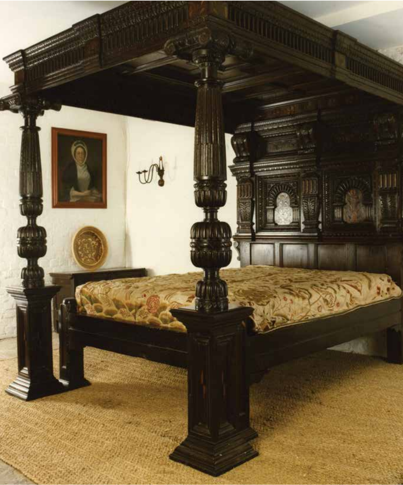
2. Corbet Tester Bed (B7) 204cm (w) x 257cm (h) x 226cm (L) To suit 170 x 200cm mattress £26,845.83 ex VAT £32,215.00 inc VAT