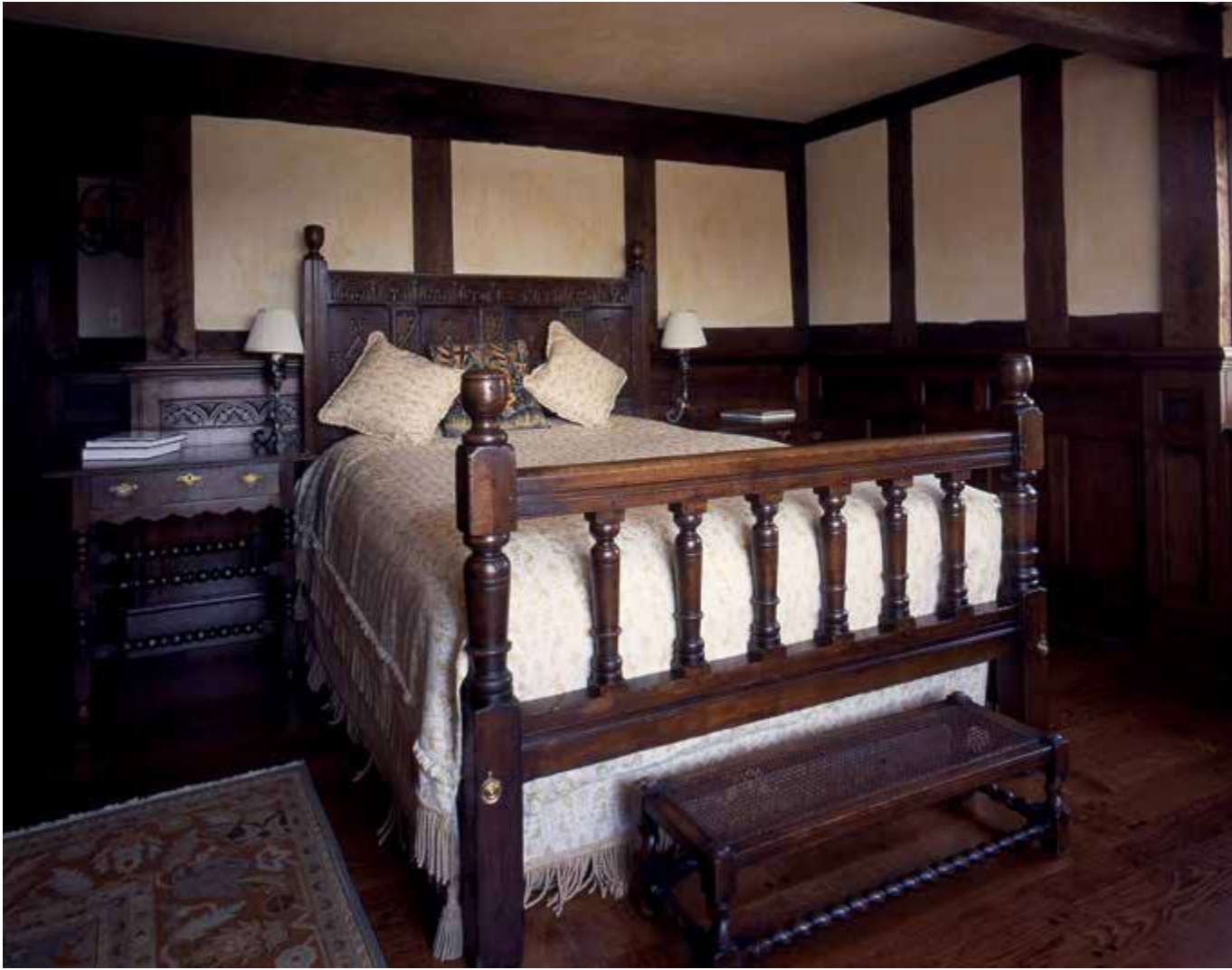
3. Charles II Half Headed (B6) 152cm (w) x 168cm (h) x 213cm (L) To suit UK King size mattress £5,112.50 ex VAT £6,135.00 inc VAT