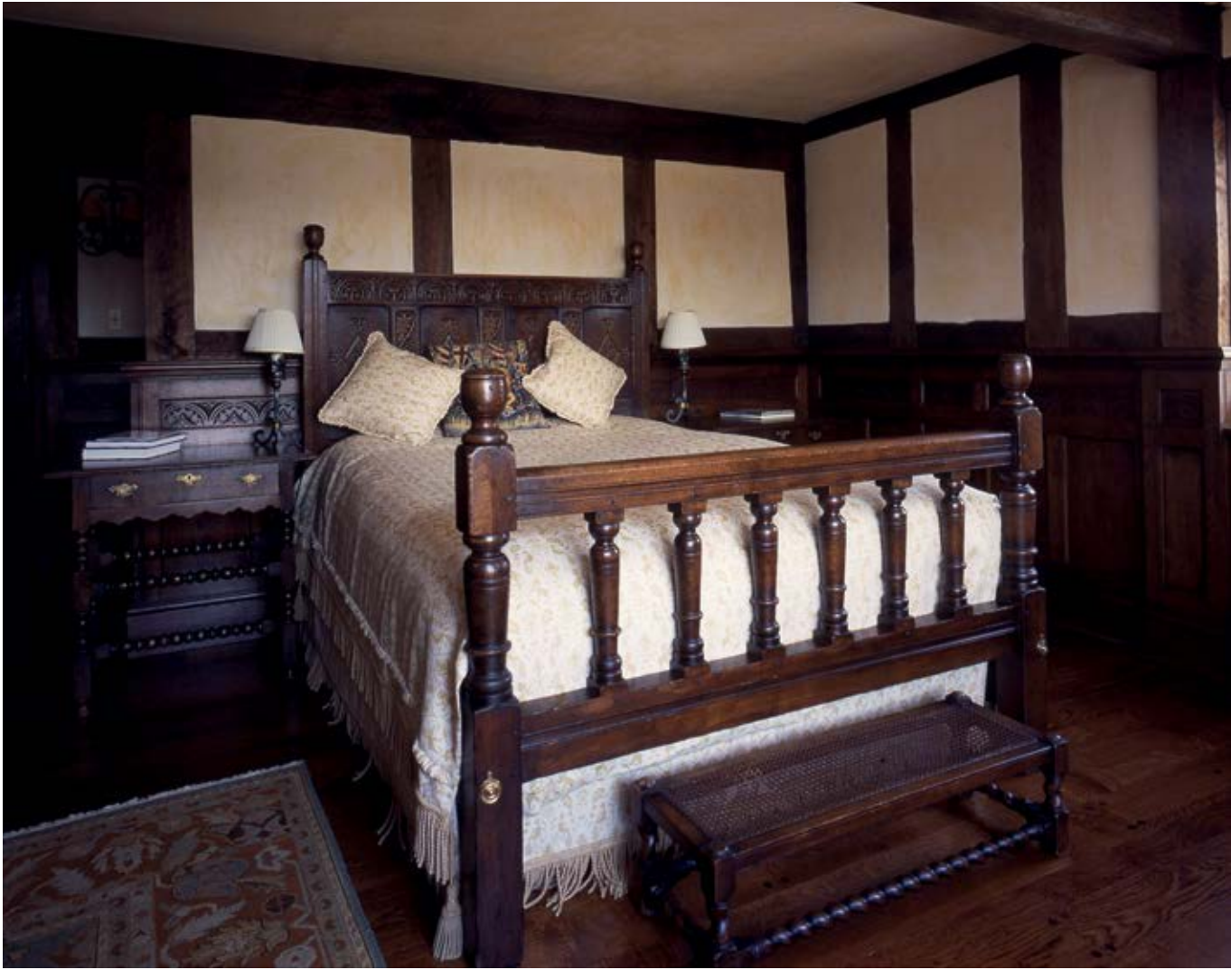
3. Charles II Half Headed Bed (B6) 152cm (w) x 168cm (h) x 213cm (L) To suit UK King size mattress £5,625 ex VAT £6,750 inc VAT (Frame only - excludes mattress, fabric and trimmings)