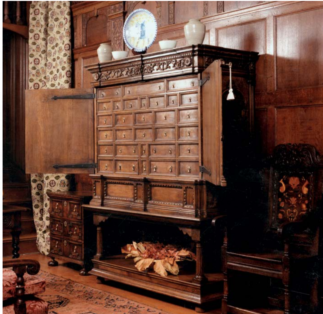
8. Laudian Cabinet (C14) 152cm (w) x 71cm (d) x 213cm (h) £20,260 ex VAT £24,312 inc VAT