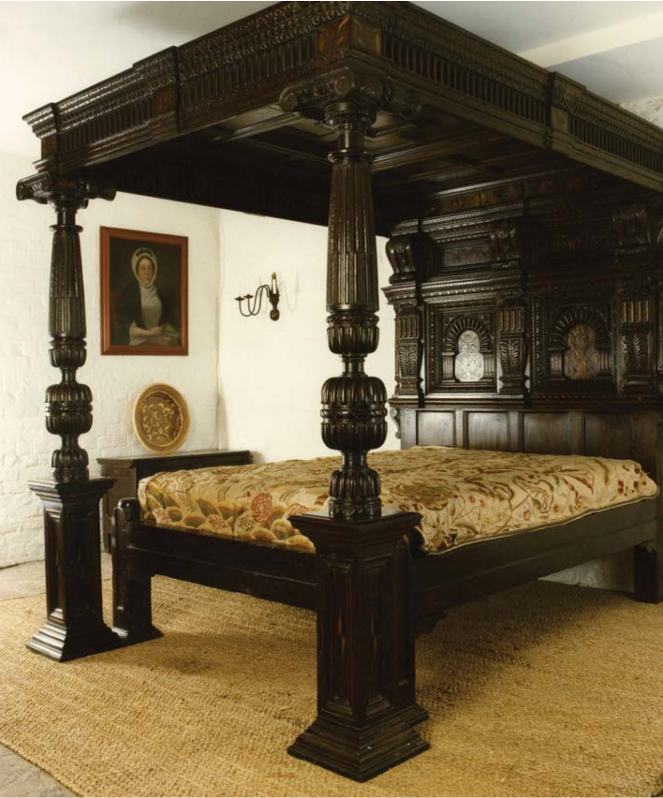
2. Corbet Tester Bed (B7) 204cm (w) x 257cm (h) x 226cm (L) To suit 170 x 200cm mattress £29,530 ex VAT £35,436 inc VAT (Frame only - excludes mattress, fabric and trimmings)