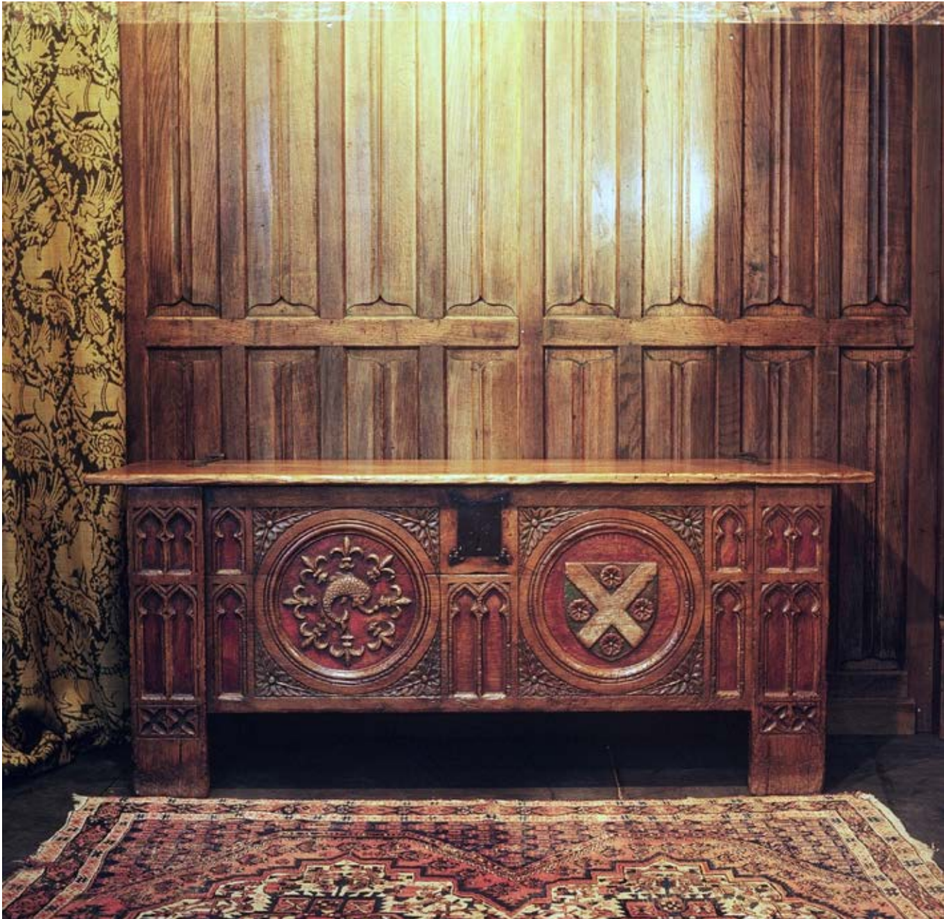
10. Medieval Great Chest (C16) 183cm (w) x 61cm (d) x 76cm (h) £5,150 ex VAT £6,180 inc VAT