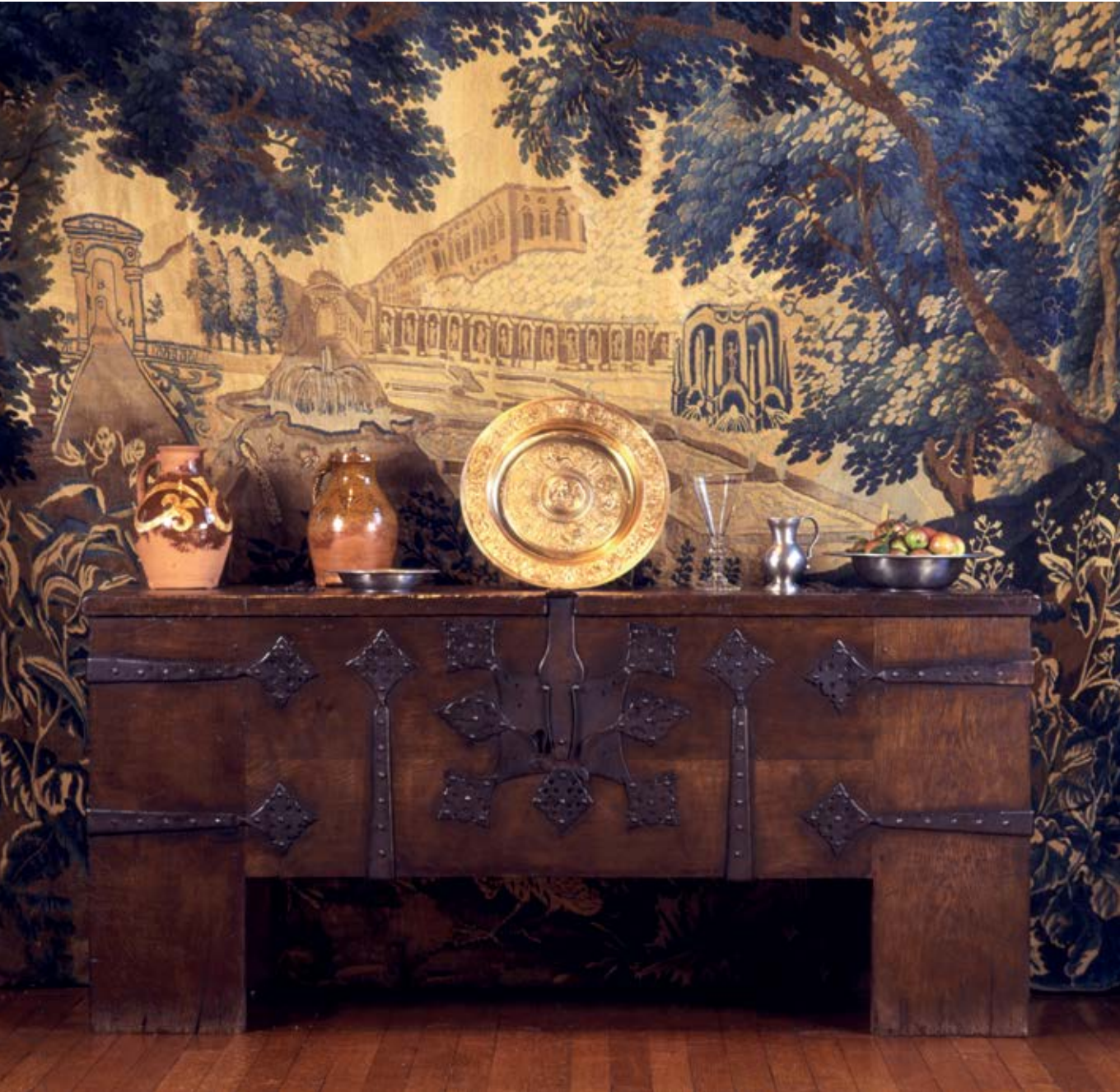
9. Medieval Coffer (C19) 188cm (w) x 63cm (d) x 91cm (h) £6,700 ex VAT £8,040 inc VAT