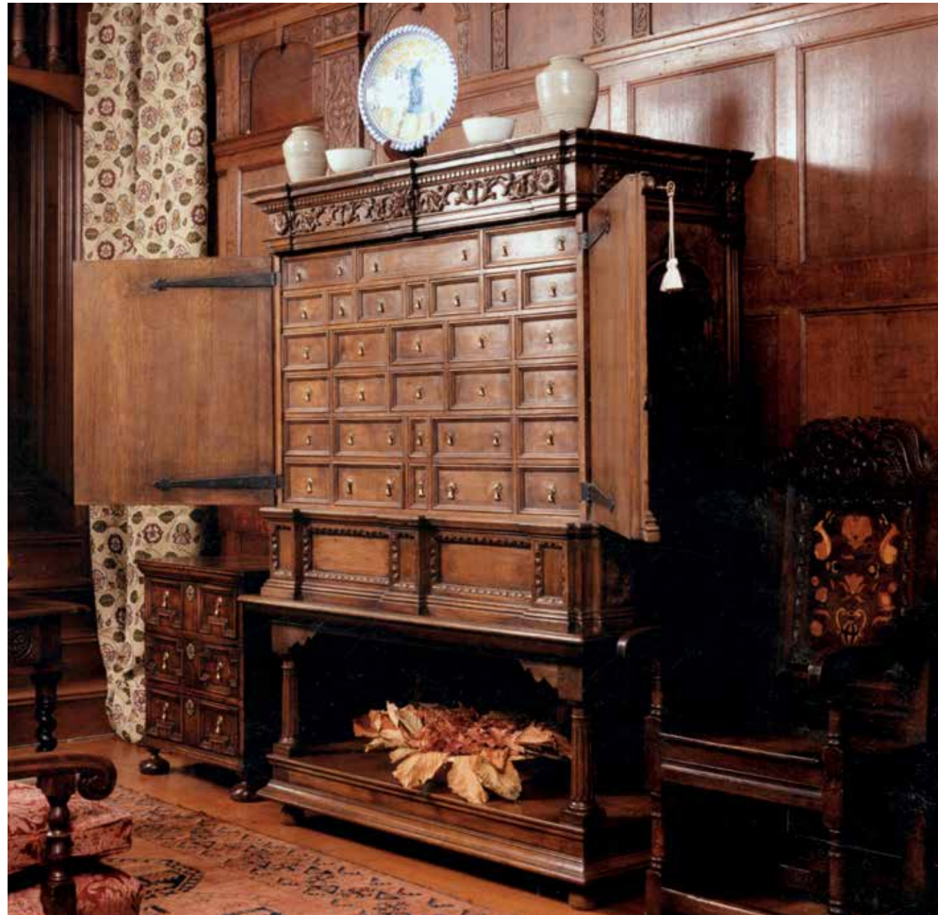
8. Laudian Cabinet (C14) 152cm (w) x 71cm (d) x 213cm (h)