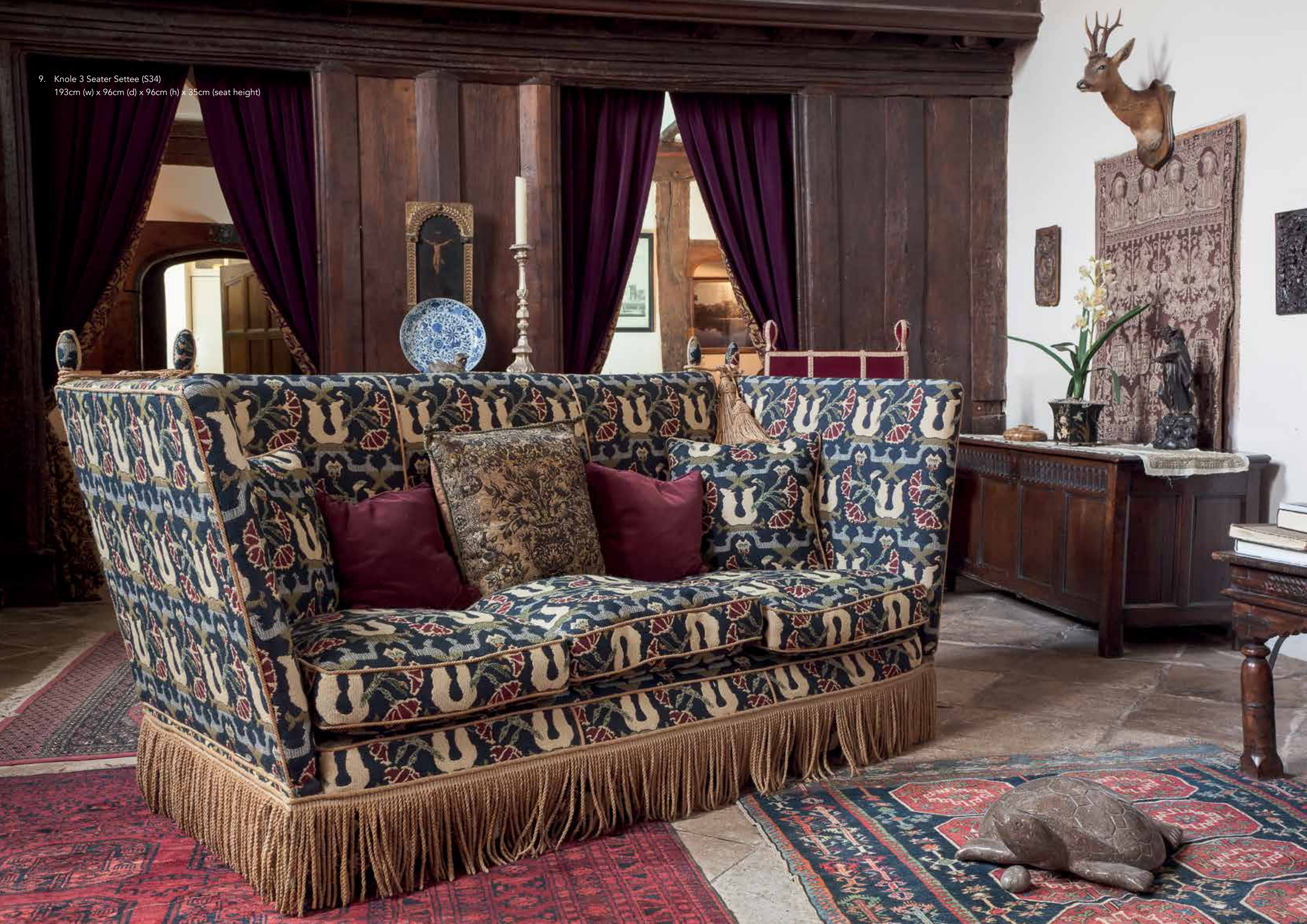
9. Knole 3 Seater Settee (S34) 193cm (w) x 96cm (d) x 96cm (h) x 35cm (seat height)