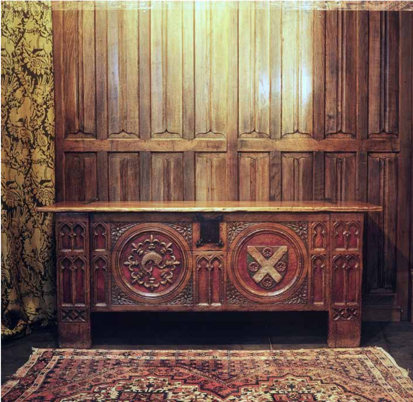
10. Medieval Great Chest (C16) 183cm (w) x 61cm (d) x 76cm (h)