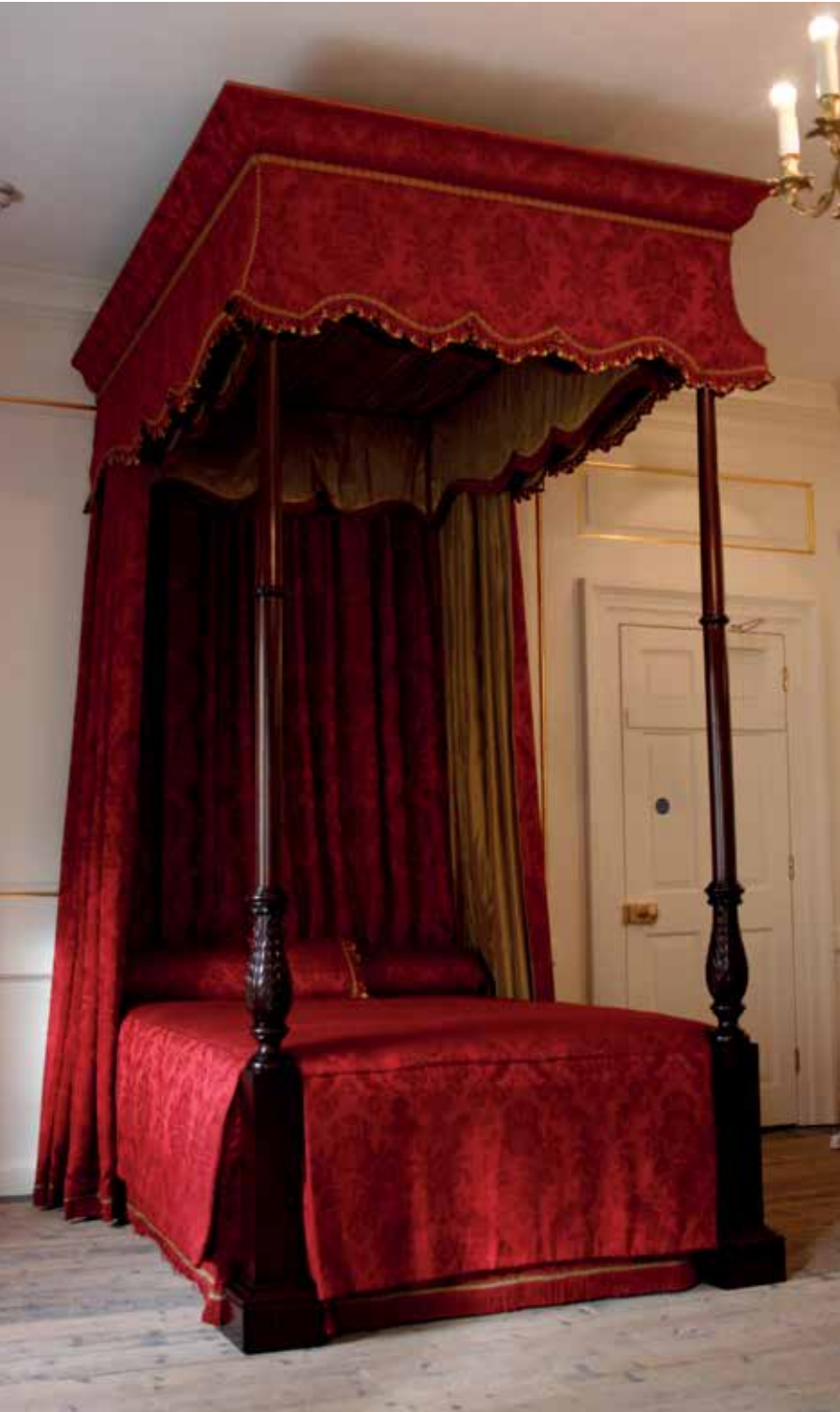
6. C18th Stepney Tester Bed (B8) 168cm (w) x 300cm (h) x 229cm (L) To suit UK King size mattress 7. William & Mary Tester Bed (B4) 168cm (w) x 297cm (h) x 229cm (L) To suit UK King size mattress